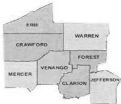
Northwest Pennsylvania—Cumulative Data