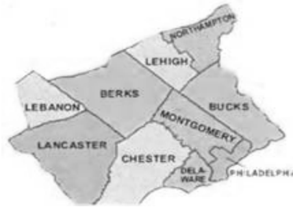
Southeast Pennsylvania—Cumulative Detail