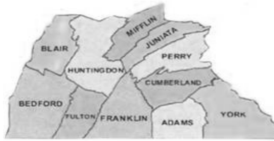
Southcentral Pennsylvania—Cumulative Data